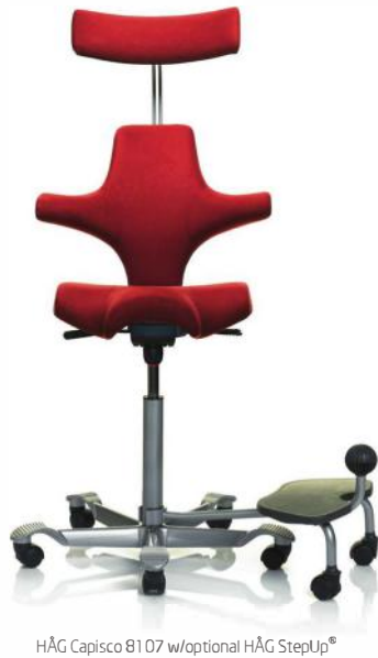
HÅG Capisco 8107 w/optional HÅG StepUp®